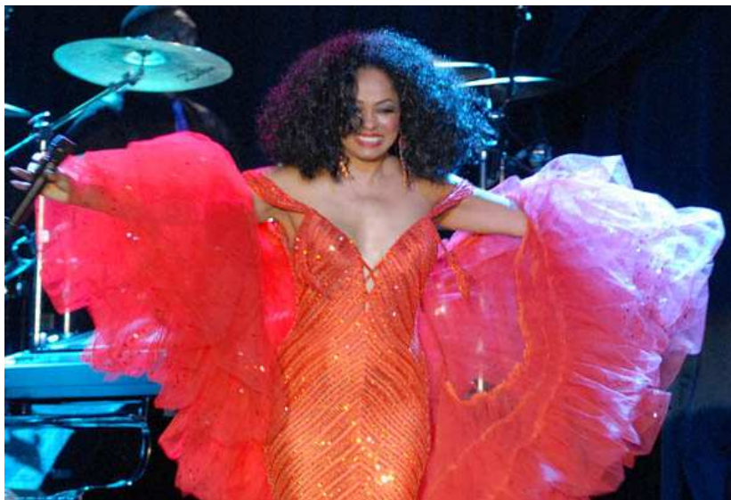
Supreme Lady in Red - Diana Ross at the Evening Under The Stars Gala.

The fog rolled into town but the stars were still shining in Southampton as over 500 people at the Evening Under the Stars Gala for the Diabetes Research Institute excitedly awaited the supreme diva, Diana Ross. The athletic fields at Stony Brook Southampton were transformed for the evening into a massive tented cocktail area and ballroom by none other than event impresario Barton G. Guest glided up the white carpet covered stairs and entered glass doors into a space dressed in chartreuse upholstered walls, elegant white columns, and sleek white curved bars. Waiters passed delicious lamb chops, mini crab cake sandwiches, and scallops casino as the champagne flowed freely. Eager fans tried to sneak a peek into the ballroom but the conscientious security was having none of that – we had to be patient.